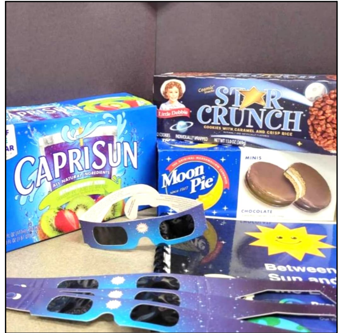
Getting Ready for the Eclipse