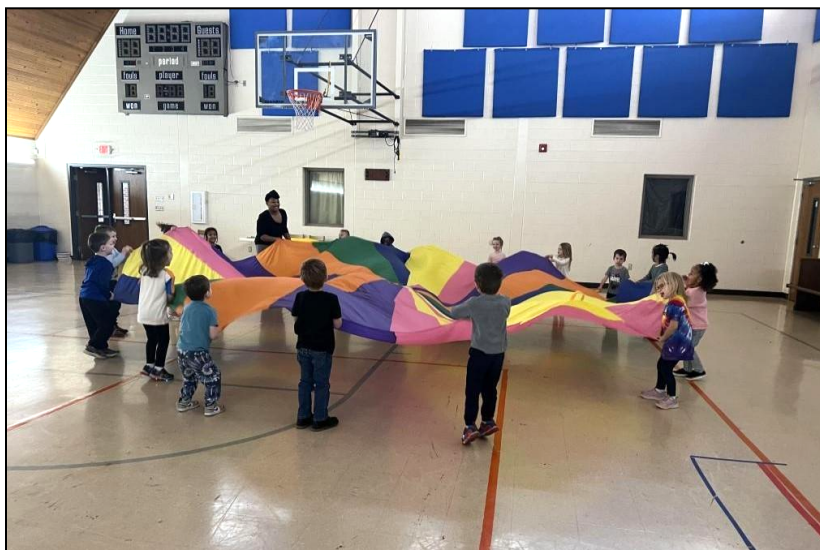
Fun time in the gym when the weather is cold!