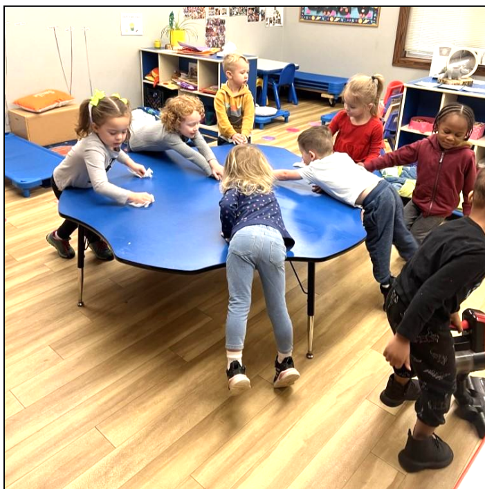
Look at us learning how to clean up!