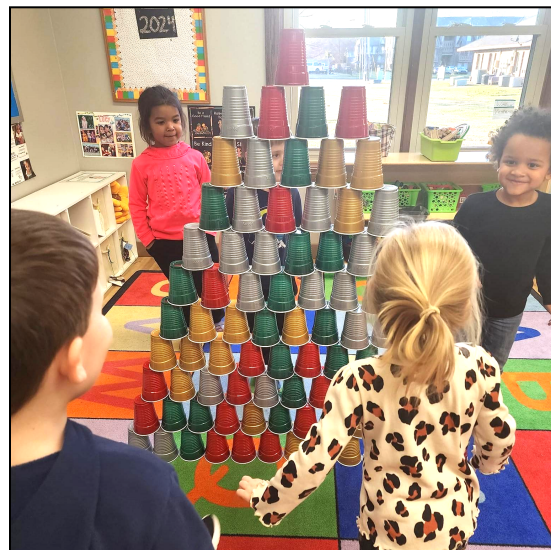
Having fun stacking cups.