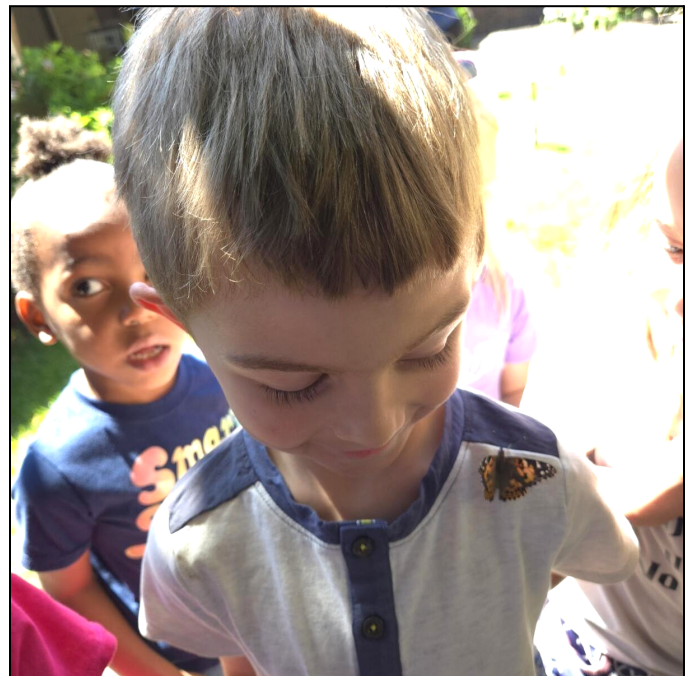
Our butterflies have emerged!