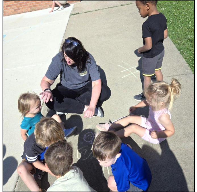
Enjoying some outdoor fun!